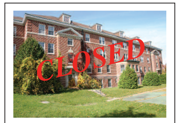
Huronia Regional Centre in Orillia

1974 The Developmental Services Act is passed, providing the legislative framework for the creation and operation of community services for people who have an