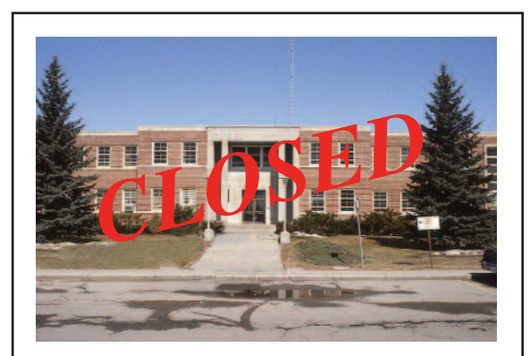
Rideau Regional Centre in Smith Falls

1985 St. Lawrence Regional Centre (Brockville), Bluewater Centre (Goderich), START Centre (St. Thomas) and Pine Ridge Centre (Aurora) are closed