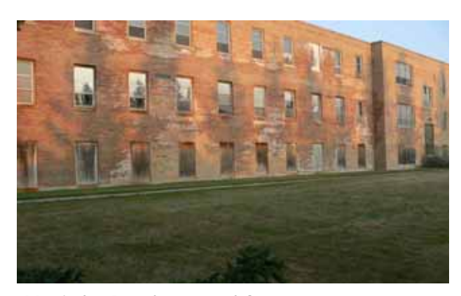
Manitoba Developmental Centre

However, active planning has commenced to assist 20 people to leave during 2007-2008, and an intention to set a new target for 2008-2009. Staff have been appointed to develop transition plans for those residents who are being transitioned into community settings. The Department of Family Services and Housing recently sent 'study' teams to meet with government and community groups in British Columbia, Ontario and Newfoundland and