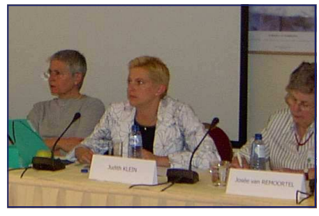
Representatives of ECCL's Management Committee at the Right to Live in the Community Seminar

Also in June, the number of Management Partners grew to seven, as the European Disability Forum joined the Management Committee as one of the founding organisations.